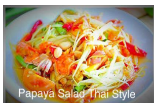
Papaya Salad Thai Style