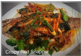
Crispy Red Snapper