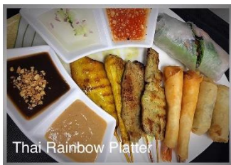
Thai Rainbow Platter