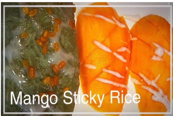
Mango Sticky Rice