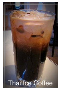
Thai Ice Coffee