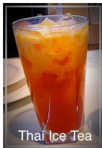
Thai Ice Tea