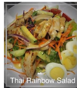
Thai Rainbow Salad

Green papaya, peanuts, carrots and tomatoes in tasty chili sauce, fried shrimp and pickled Thai crab sauce.