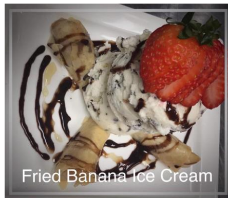
Fried Banana Ice Cream