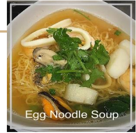
Egg Noodle Soup