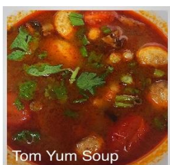
Tom Yum Soup

Combination of seafood soup with mushroom, lime, lemon grass and Thai Basil