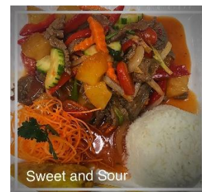
Sweet and Sour

Fried Tilapia (fillet or whole fish) topped w/ chili peppers and onion in tamarind sauce, carrots, bell peppers and green onions