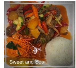
Sweet and Sour

Fried fish fillet topped w/ chili peppers and onion in tamarind sauce. Please select your preferred amount of spice.